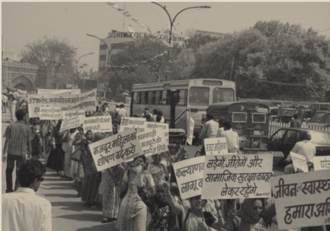
Thousands of women workers from the Self Employed Women's Association (SEWA), India, took to the streets of Delhi in March 2008 to demand a Social Security Act for the unorganised sector which comprises 94% of the country's work force. The timely passing of the 'Unorganised Workers' Social Security Act' in December 2008 is expected to provide the necessary safety net for tens of thousands of workers who face the prospect of losing their jobs due to the global economic melt-down.