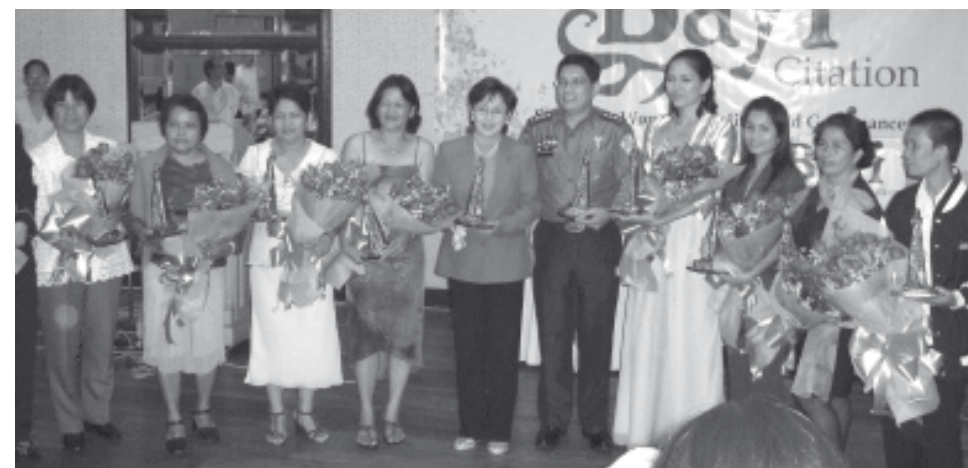
Winners of the Bayi Citation Award 2007. The Award is given biannually to ten champions of women's rights and good governance, Philippines.

And finally, a recommendation to the AEPF Organising Committee to set up processes to implement its agreed gender and disability commitments and to eliminate bias in participation, selection of panellists, speakers, chairpersons and discussants.